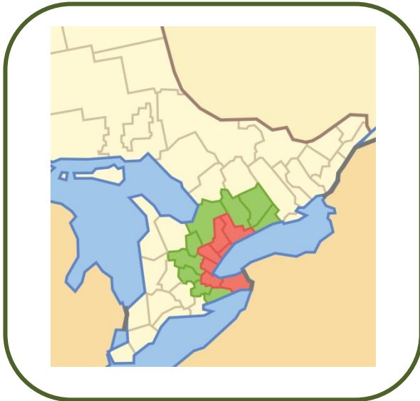
The Golden Horseshoe (in red)