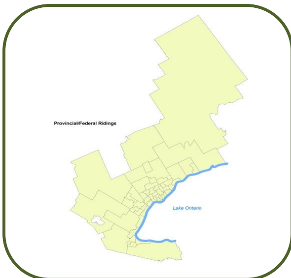
Featured Provincial/Federal Ridings

7,005,486 people live in The Golden Horseshoe 1,112,588 live in poverty – 17.4%*